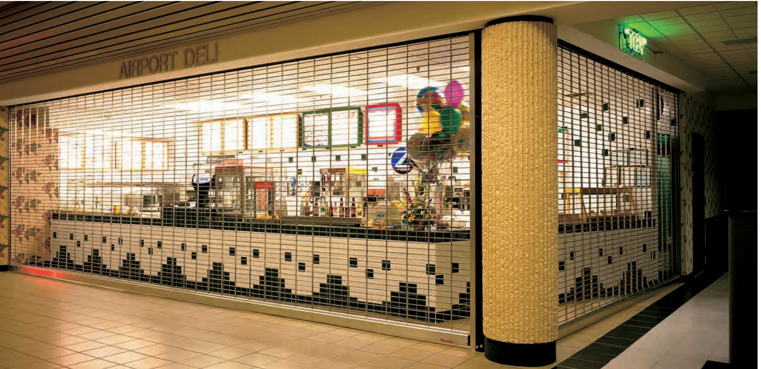
Installation and Service: Overhead Door Company of Huntsville