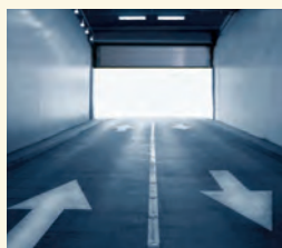
Advanced Rolling Steel Door RapidSlat®