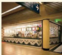
Rolling & Side Folding Security Grilles & Closures