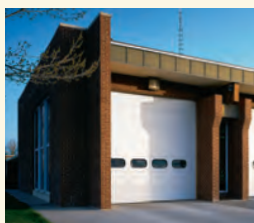
Thermacore® Sectional Doors