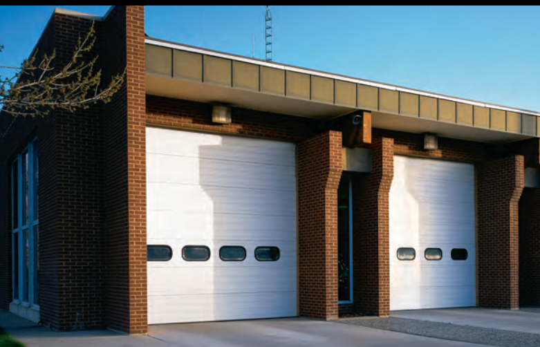
Installation and Service: Overhead Door Company of Twin Falls