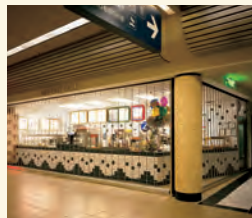
Rolling & Side Folding Security Grilles & Closures