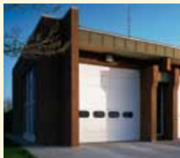
Thermacore® Sectional Doors