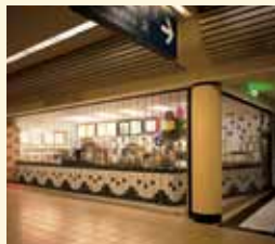
Rolling & Side Folding Security Grilles & Closures