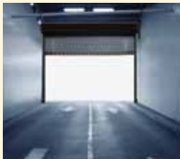
Advanced Rolling Steel Door RapidSlat®