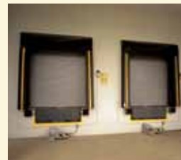
Rolling Service Doors