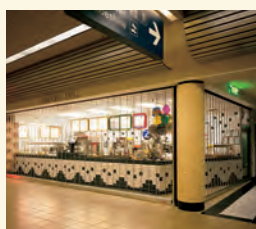
Rolling & Side Folding Security Grilles & Closures