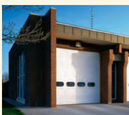
Thermacore® Sectional Doors