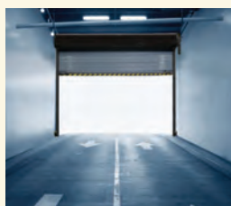
Advanced Rolling Steel Door RapidSlat®