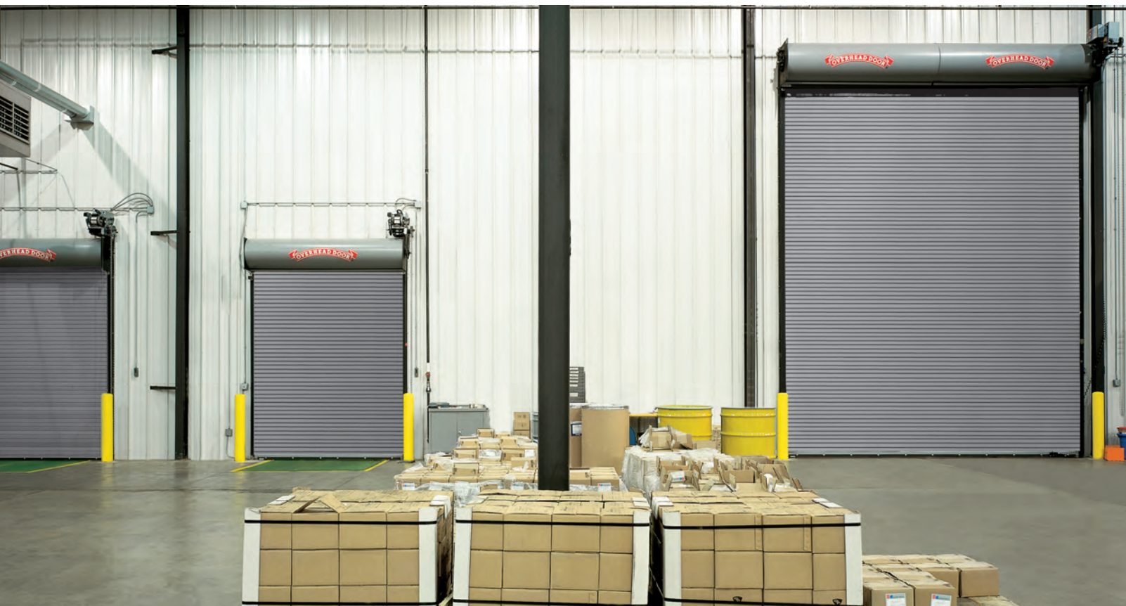
Installation and Service: Overhead Door Company of Huntsville