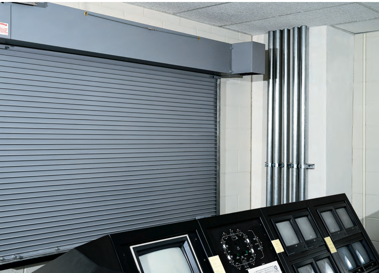
Shown with optional flame baffle for FM