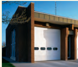
Thermacore® Sectional Doors