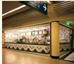
Rolling & Side Folding Security Grilles & Closures