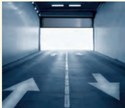
Advanced Rolling Steel Door RapidSlat®