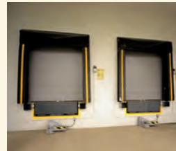
Rolling Service Doors