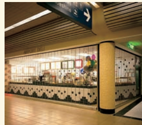
Rolling & Side Folding Security Grilles & Closures