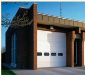
Thermacore® Sectional Doors