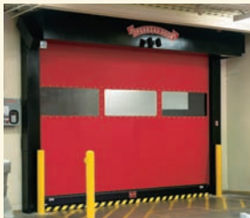
JetRoll® High Speed Doors