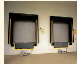
Rolling Service Doors

Today, Overhead Door Corporation—along with our associate company, Horton Automatics, for automated pedestrian entrances—is recognized as the leading, single-source manufacturer of integrated door and operator systems for commercial, industrial and residential applications. With multiple manufacturing locations throughout the United States, a state-of-the-art International Technical Center for design and engineering, and a national network of authorized Ribbon distributors, our capabilities are leading-edge and our field service and technical support second to none. Built best and backed best, Overhead Door is the industry's leading choice for quality that shows and lasts.